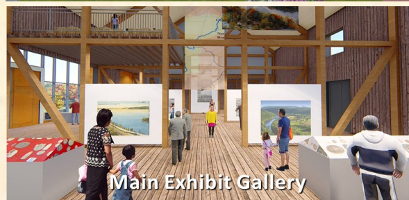
Main Exhibit Gallery