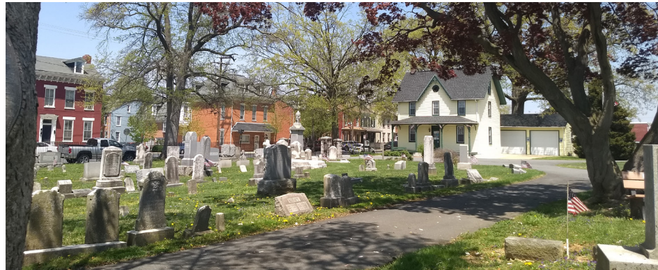
55 Mount Bethel Cemetery