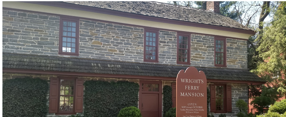
58 Wright's Ferry Mansion